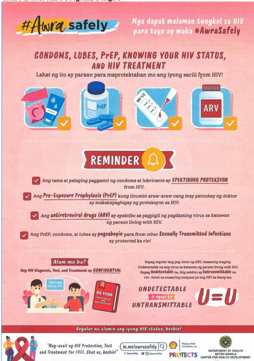
AIDS POSTER 18x24 INCHES (design2)